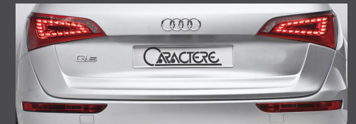
Bas de hayon Onderste deel van de achterklep Heckklappenansatz Rear hatch blend