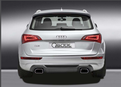
Spoiler arrière Achterbumperspoiler Heckschürze Rear bumper spoiler