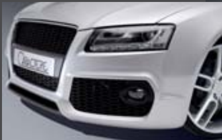
AUDI A5 CABRIO & AUDI A5 CABRIO «S-LINE»*

Antibrouillards originaux Originele mistlampen Originale Nebelscheinwerfer Original fog lights